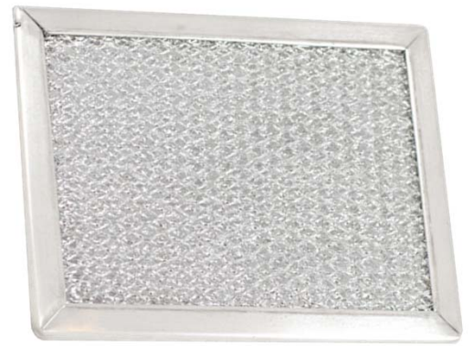
MODEL #RH-1/8 MODEL #RH-1/4 MODEL #RH-1/2