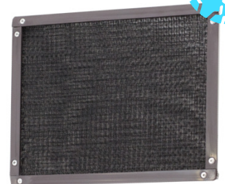
Patent No. US 6,793,715