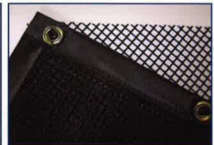
Double height mount kit available for HailStop & PreVent Filter together.