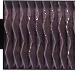
GOOD A/C FINS