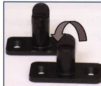
Moveable tab opens & closes for secure installation & easy removal to clean.