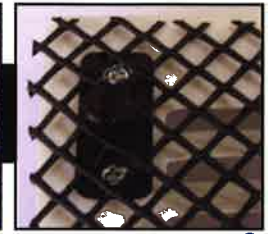
EASY FIX HailStop®

Lightweight and easy to install, the rigid polypropylene netting deflects airborne objects and debris such as hail. Unique mount clips are easily attached to the equipment. HailStop fits onto clips and the moveable tab closes into locking position. Sold in single job kits and master rolls, netting can be cut-to-size with sissors or a utility knife. Netting can be used alone as hail guard or layered behind PreVent® Equipment Protection Filters for added air intake protection.