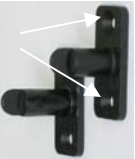
MOUNT USING (2) #6-3/4" SELF TAPPING SCREWS