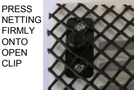
PRESS NETTING FIRMLY ONTO OPEN CLIP