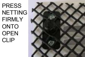
PRESS NETTING FIRMLY ONTO OPEN CLIP