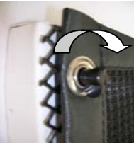
MOVEABLE TAB FACES DOWNWARD TO LOCK