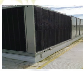
100 ton Trane Unit AFTER with durable, cleanable PreVent air filter screens